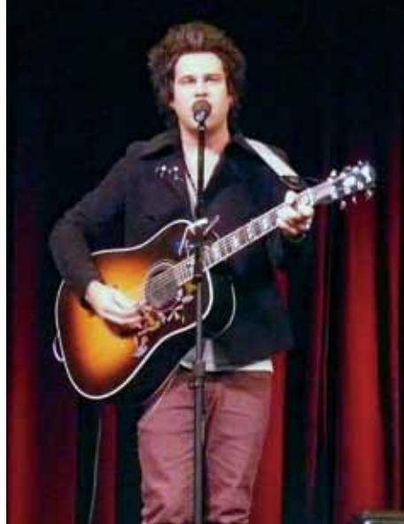
Singer, songwriter and guitar player Ryan Cabrera performed December 2 in the Maggie Hardy Magerko Auditorium.