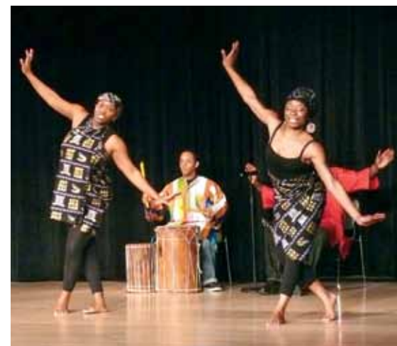
2010's Martin Luther King Jr. observance on January 19, featured a performance by Umoja, an African dance and drum ensemble.