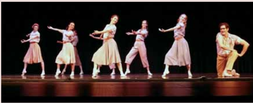
The Pittsburgh Ballet Theatre returned to Fayette County and the campus May 6. The performance was a mixed repertoire of two ballet works, including "Company B," set to the swinging tunes of the Andrews Sisters, and "Step Touch," which featured classic songs that showcased doo wop favorites. The performance was supported by The Eberly Foundation.