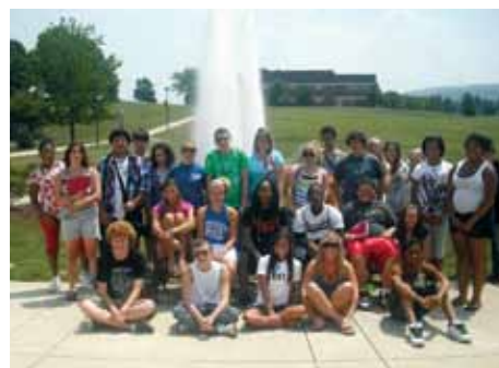
Science Forensics: An Academic Pathway in Science, Technology, Engineering, and Mathematics completed its fourth year. Dozens of high school students who are part of the program returned again to Penn State Fayette for the special summer camps where they explored an array of STEM subjects.