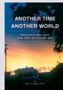
Book cover of Leisenring II (Bute) circa 1950.