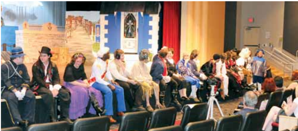
The Lion Players presented its 13th annual production, The Comedy of Errors in April. One of Shakespeare's earliest plays, it is a farcical tale of mistaken identity with wrongful beatings, a near-seduction, and accusations of theft, infidelity, and madness.