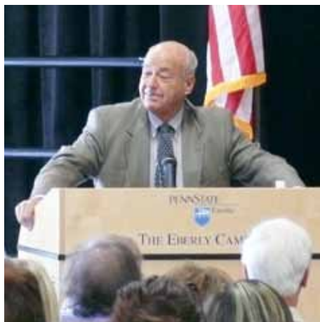
Dr. Cyril H. Wecht, MD, JD, a recent Distinguished Forensic Scientist award winner and former coroner and medical examiner of Allegheny County, spoke at the campus October 21. As one of the country's leading forensic pathologists he spoke about, among other things, the assassinations of President John F. Kennedy and Senator Robert F. Kennedy, the death of Elvis Presley, the O.J. Simpson case, and the JonBenét Ramsey case.