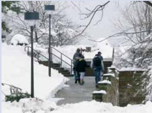
In February 2010, the snow started falling and seemed to never stop. Here a group of students brave the elements to get to class.

suggested, the student body shows character as students face the freezing cold and sacrifice their spare time to combat one of the most deadly diseases. Without a doubt, this is an accomplishment Fayette should be very proud of as the campus contributes to the world's largest student driven philanthropy.