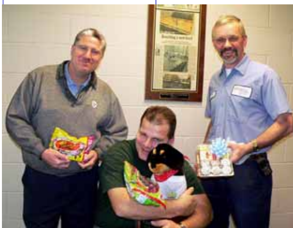
LOSING IS THE BEST!!