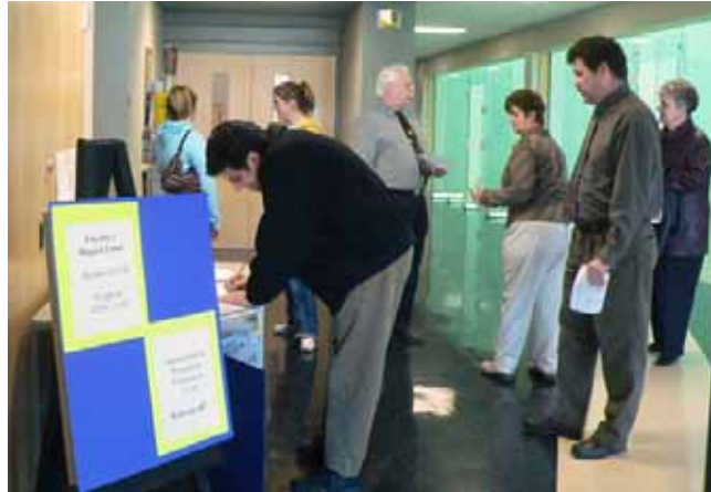
FIRST DAY . . . SIGNING IN AND FACING THE SCALE!

What's all the excitement on campus? Fayette's Biggest Loser has everyone energized to exercise, eat right and lose those extra pounds in the process. Nine highly competitive teams are engaged in winning the weekly team award – the traveling dog – as well as the final, individual prize– a trophy, a one-year membership to the fitness center, and an exciting weekend getaway package.